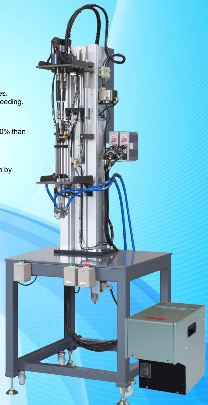
Example of machine configuration.