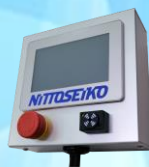
Touch operation panel 【Optional】