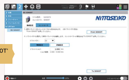
URCap 'NS SD600T' screen images

URCap "NS SD600T" enables easy installation setups on UR teach pendant and simple intuitive configuration of screwdriving parameters (torque value, rotation speed, etc.) stored on "SD600T" controller.